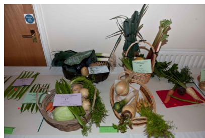
A collection of vegetables : winner Monica Dowson