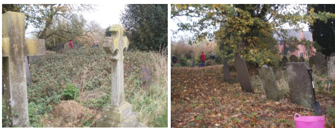
Work in progress in St Peter's Churchyard