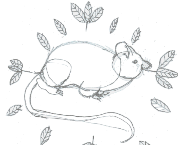
Autumn picture by Lucy Ring